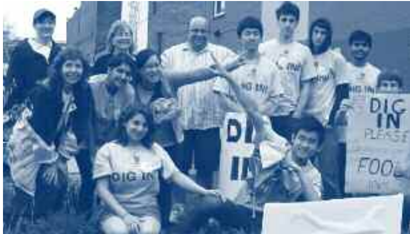
The 2011 Healthy Lifestyle Ambassadors DIG IN – May 2011

In 2011 – the second year of the event – the Cambridge Self-Help Food Bank joined in, expanding the impact of the one-day drive to the 30 food programs they serve in addition to the more than 70 served by The Food Bank of Waterloo Region. Leadership Waterloo Region alumni and staff were instrumental in planning as well as in taking the lead for innovative components such as the Mayor's Kick-off event in 2010, the media food sorting challenge in 2011, Manitou's Got Drive (filling a Coach Bus with donations from Manitou Drive with WRPS escorting the delivery), Battle of